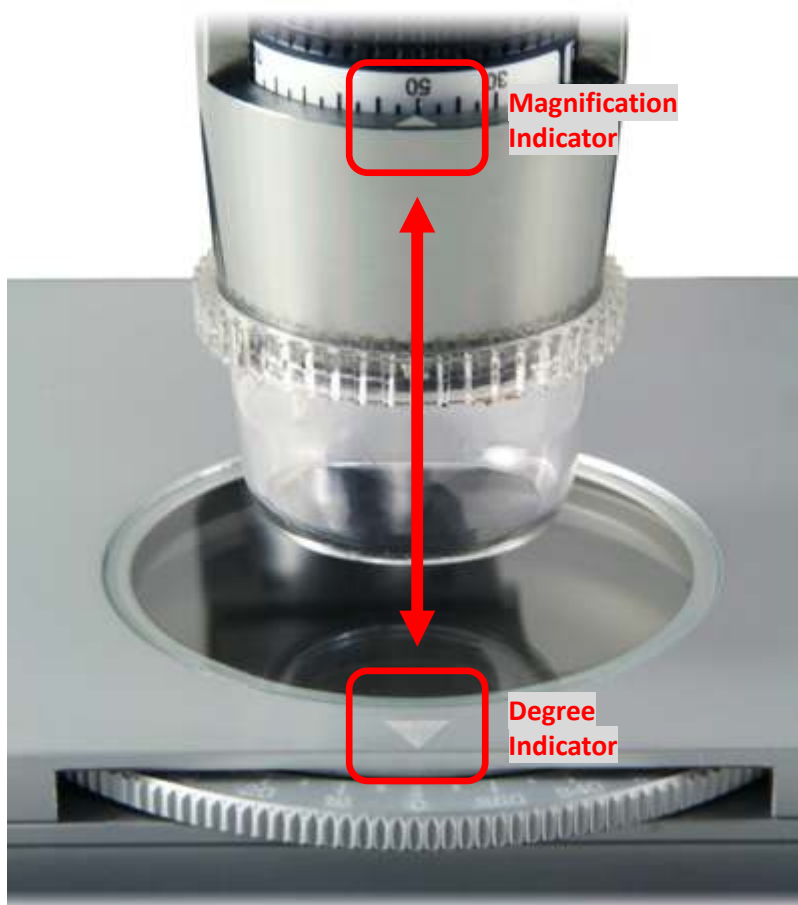
Fig.2. Align the degree indicator of the BL-ZW1 to the magnification indicator of a Dino-Lite with polarizer.